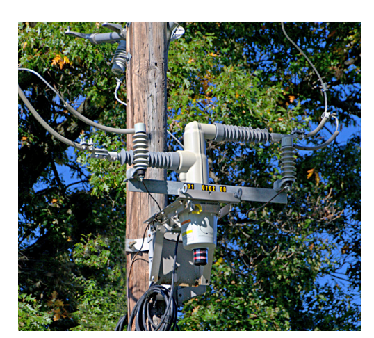
Viper-SP pole mounted application

The Viper reclosers are system-tested with their recloser control and control cable. In order to guarantee proper operation within the Clearing Time performance, G&W performs routine tests per the above mentioned recloser standard and includes individual phase timing checks, synchronicity, endurance, minimum current pickup tripping, and 4-shot sequence time over-current tests.