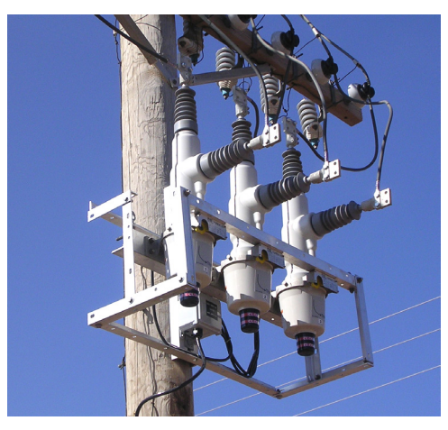
Viper-ST pole mounted application